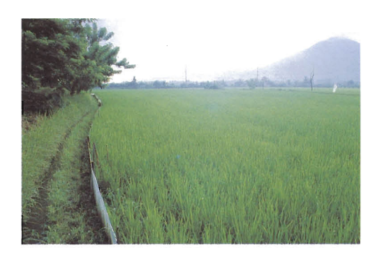
Plate 8. A linear barrier with traps on trial in the Philippines. The barrier is located between a likely rat harbourage and the developing rice crop.