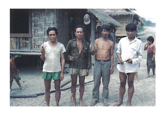
Plate 11. Various bamboo devices which garrotte or shoot (using a crossbow) rats have been developed by Laotians living in the uplands near Luang Prabang.