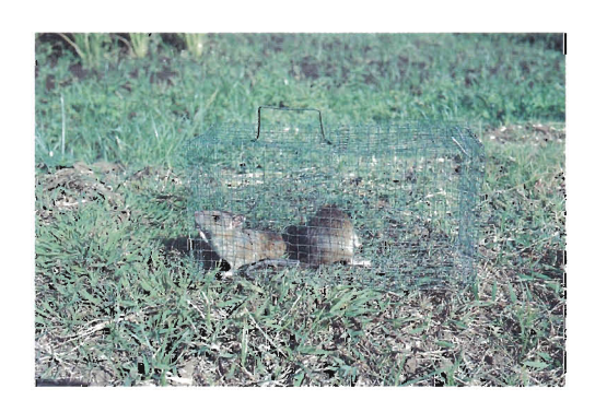
Plate 3. Wire live-capture traps with conical entrances are used in Malaysia, Philippines and Indonesia.