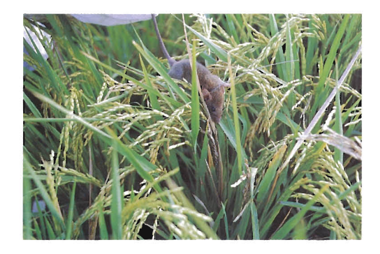
Plate 5. Rats are fitted with radio-collars to enable their movements to be tracked.