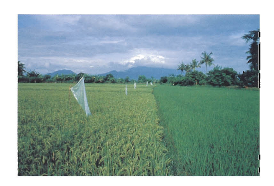
Plate 1. Sowing rice crops asynchronously prolongs the breeding season of rats — since rats breed from when the rice is milky ripe to when it is harvested.