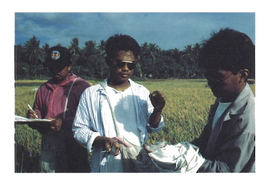
Plate 4. Processing of rats for information on their demography and breeding condition, Luzon, Philippines.